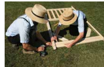
Made by skilled Amish craftsmen in Lancaster County, Pennsylvania.