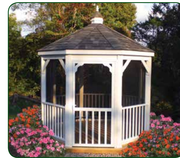
Keep the bugs out with a screen package!