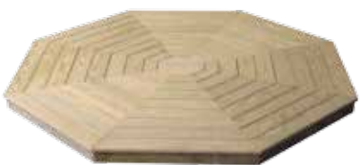
8 ft. Deck - $895