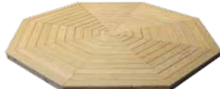
10 ft. Deck - $1,295