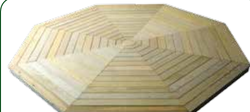
12 ft. Deck - $1,695